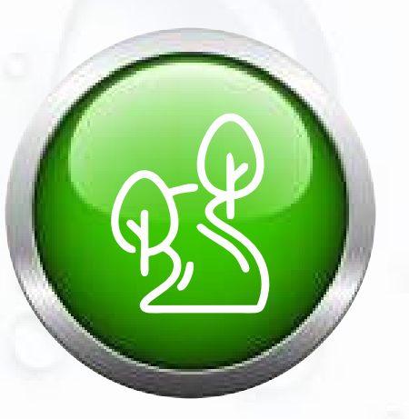
Dam view from the plot