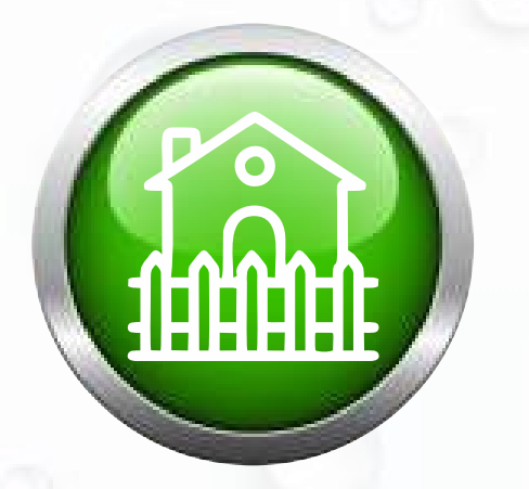
Farmhouse plots at Muthwali