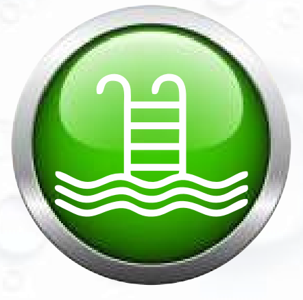
Bungalow with swimming pool and without swimming pool

1 RK (280 sq.ft.) Bungalow for 5000 sq.ft.