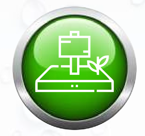
Total Project 70 acrs