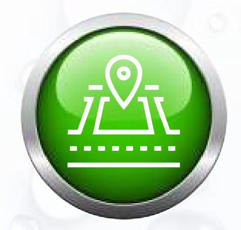
Plot size min 5000 sq.ft. and above